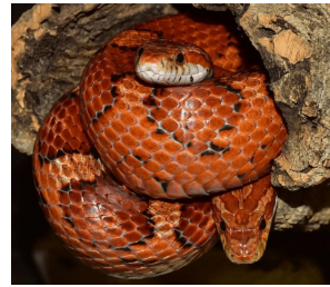
Rainforest visitors: tarantula, African land snail, corn snake

1 African land snail This lives on the first layer on the forest floor. Their shell is made of keratin (the same as our hair and nails). Its slime is used in hand sanitizer and face wash. It has 10,000 teeth! Ours was called Eva.